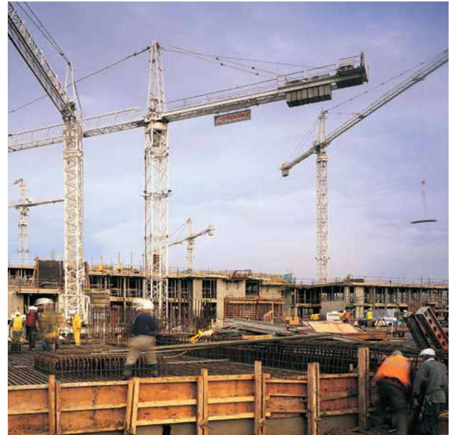
Capacity to handle large projects

Transport and Logistics Building and construction General Service division