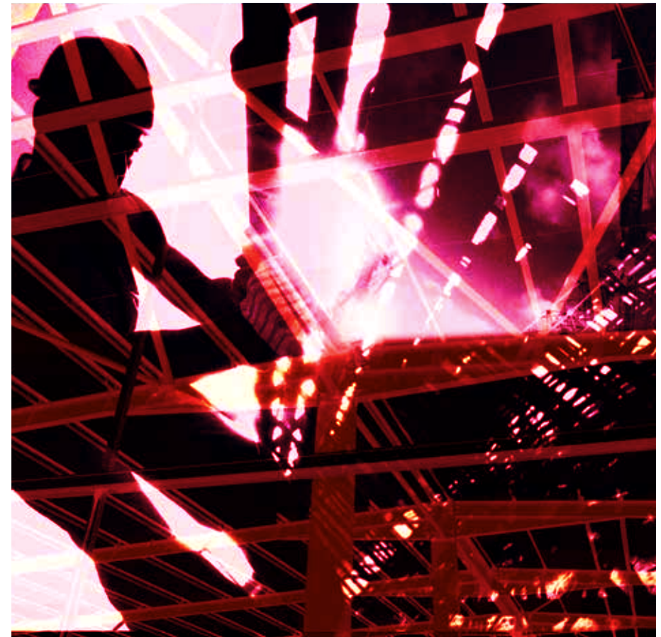
Our employees are highly technically qualified personnel

An appropriate management structure ensures that all employees are guided well to deliver best results.